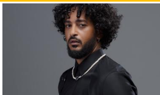
France Slimane - Mon amour